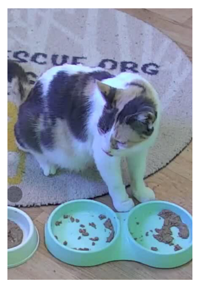
Image above - Rudy, snacking and thinking about gambling without actually going to do it.

Subscribe again for more about Rudy and her kitten's job situations!