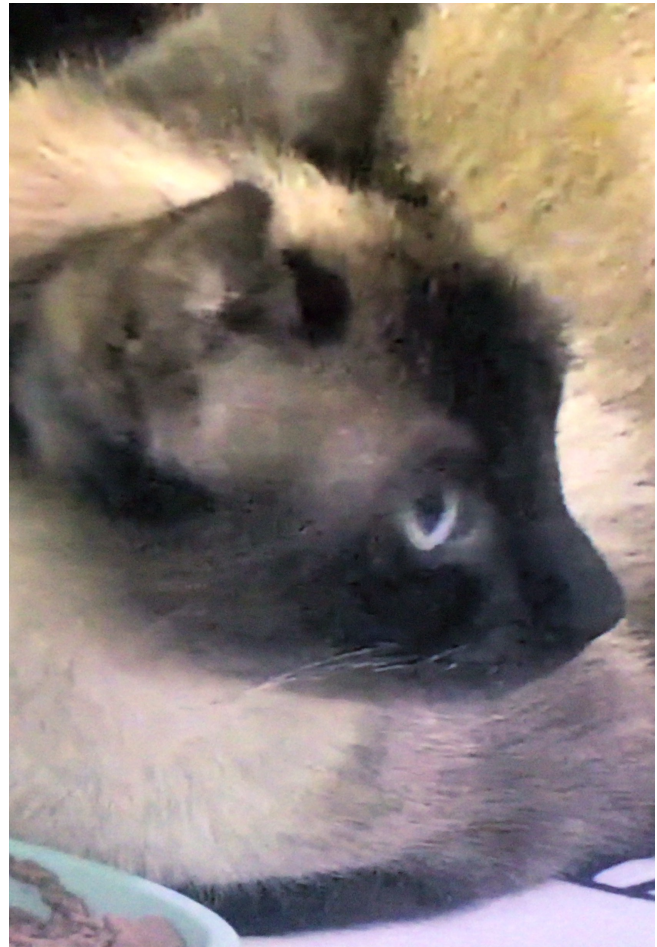
Image above - Lunch, who is feeling betrayed as she hears all of the crimes stated against Judy.

Judy stepped up to the podium, and then spoke. "You may not like what I did, but life isn't always fair. You won't always get what you want, but once something is done, you have to follow it through. I've paid over 10,000 dollars to make ads and special clips of this movie. I've spent hours pouring over the film, deciding what to add and what to cut. You may not like what I've done, but you can't just ask me to throw away the film. I need the money that the movie would make. And you want to throw away the film. I can't allow you to do this. I yield the podium." Judy stepped down, and the judge called the final speaker, Stripy.