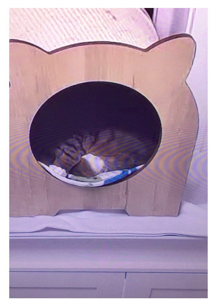
Image above -Harvey's motionless body in the machine. It's pretty subtly hidden, huh?

Subscribe again for more on this "movie"!