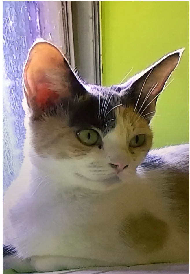
Image above - Rudy, who's getting a bit worried about her kittens in this not as clean as it could be match.

While the players were still milling about, The Thundragon goalie started to get in position for a goalie kick. It wasn't the textbook way of how to start after a goal, but it wasn't illegal either. Ghost saw this, and then looked back toward Phantom. 2 Thundragon forwards were there, waiting for the goalie kick. Phantom was completely blocked, and Ghost tried to wave at the referee to notice this. They didn't, but Ghost had a better idea. Cats in the stands were starting to think that this time the ball would start from the Thundragon's goalie, but of course they couldn't see the players farther downfield guarding Phantom.