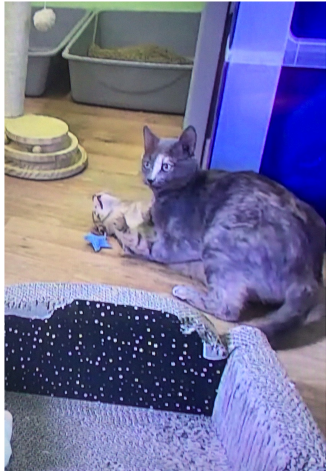
Image above - an example of kitten brutality.

"It all happened so fast," Judy told her audience, the police chief, a police officer, Max, Blackspots, and all 13 of her and Rudy's kittens. "Rudy and I were strolling in the park, I was talking about the chubby wrestling competition, and then Rudy winced at something and looked down at her chubby foreleg. There was a small wound, already leaking blood. It was a bullet hole, no doubt. Then, Rudy's attacker leapt out from the bushes and hit her over the head. She fell unconscious, and the attacker looked at me. Judy, they said in a deep voice, come with me. No, I shouted back, looking at Rudy's unconscious form, I won't! Rudy's attacker shook their head. So stupid, they muttered, and shot me in the chubby foreleg. I collapsed, and then Rudy's and now my attacker punched me in the stomach. I gasped for breath, and my attacker kicked me hard in my other chubby foreleg, and then ran off into the bushes. I called for help, and an older cat came rushing over. They called an ambulance and the police, and then I lost consciousness."