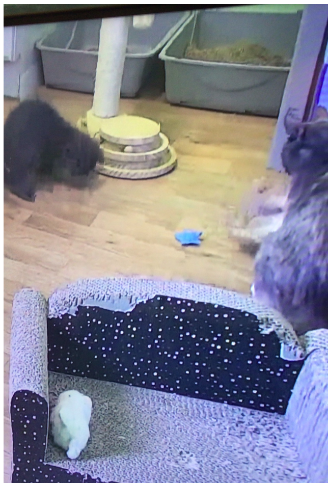
Image above - same cats, same example of kitten brutality.