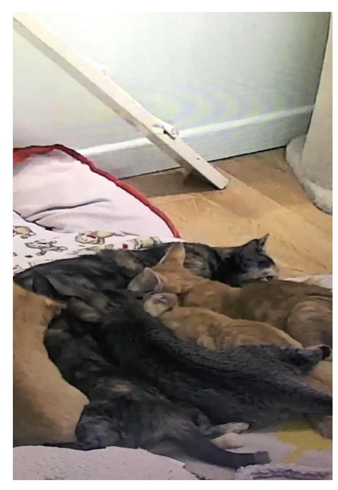
Image above - Judy, who's letting her kittens do a power suckle before starting up their game.

Now, the first group is going to start playing soon, each team in a separate comfy room. The rooms have water, soda, all the snacks you can eat, a bathroom, and even a couple of beds - cats could get tired. There are a number of game controllers for each team, and a TV that fills nearly the whole wall on one wall for the game. In the game, each character can move how they want, so on the big TV, there will be a small camera on each player, and then a big camera on the most players in one area. For this first round, the players in the game only have one tank, ten rounds of ammunition, and some armor. Forging more stuff is up to the teams, but will be needed in the coming times.