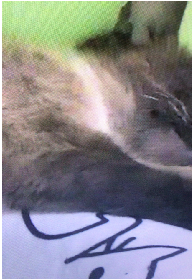
Image above - Lunch, who has some frozen sugar fries that she will be giving Harvey before he leaves for Egypt with North.

North and Harvey are happy to get out of Pawsville at least for a little, because it is springtime in Egypt, so it will be much warmer than Pawsville. North will be taking many photos, because he wants any cat viewing his and Harvey's trip slideshow to feel like they were in Egypt itself. This is North's first international experience, and he is very excited. Harvey has travelled internationally before, when he took a plane to Turkey to get some very special sugar cubes indeed.