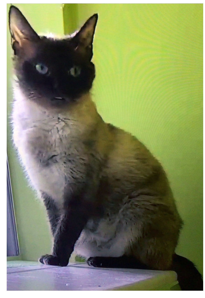
Image above - Lunch, who's going to remember to be more careful around Harvey.

weakened as if she was an old cat. Harvey would usually take offense to that, but Rudy had the flu and was in no condition to be beat up.