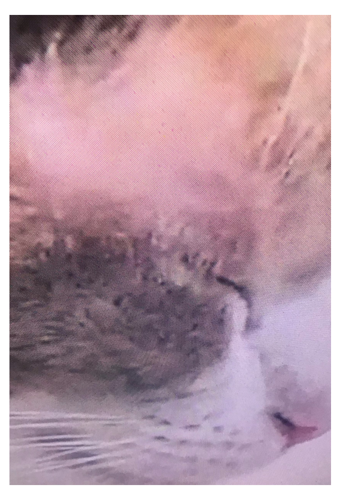
Image above - Juliet, who thinks that beer is a nighttime drink, not a morning drink.

Today when cats woke up, all of the liquids in their fridge were gone. Even the ice cream cartons were gone from the freezer. A little earlier, kittens had taken all of the liquids and put them in Lunch's Luncheon's giant walkin fridge. The fridge was guarded by a phalanx of kittens, who knew that they would be paid later in the form of fruit juice. However, the real action was in the town square, where a few kittens with bodyguards were calling adult cats to come and negotiate if they wanted to get their drinks back. Many cats came out from their houses, including Naya, who hadn't had her morning beer and wasn't happy about it.