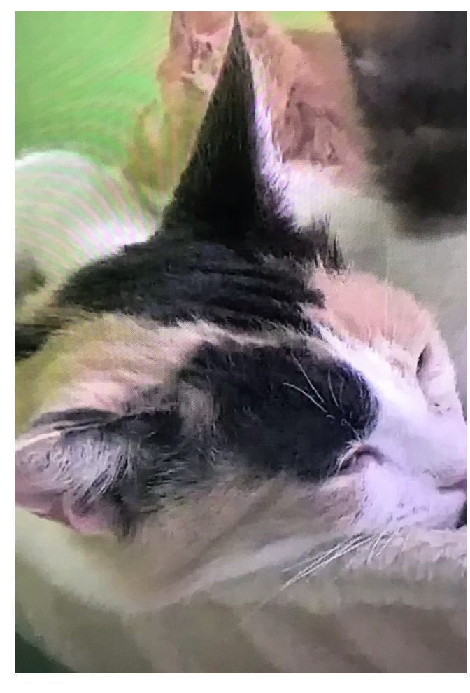
Image above - Rudy, who has also decided to get a mini fridge for her bathroom.

escalator. Unfortunately, home additions cost a lot, and most cats can't afford it. However, Lunch has called from her vacation hotel to say that she is considering getting a full minibar, serving soft drinks and alcohol. However, cats are considering different additions too, like a back porch or an indoor swing.